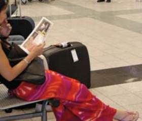
AIRPORT TERMINAL 2B