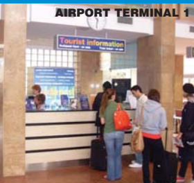
AIRPORT TERMINAL 1