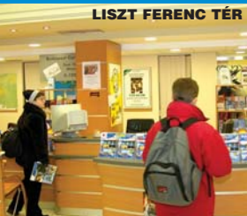
LISZT FERENC TÉR